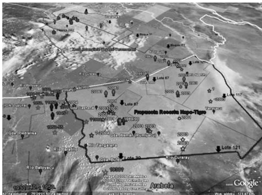
This map, using Google Maps technology, plots numerous sightings of indigenous people in voluntary isolation documented in the 2003 and 2005 anthropological reports. The blue border demonstrates the reaches of the proposed Napo Tigre territorial reserve, much of which is covered by oil block 39. Map prepared by Lukasz Krokoszynski and © TerraMetrics, Europa Technologies, MapLink/Tele Atlas and LeadDog Consulting.

These two reports contain 58 articles of evidence, including numerous eye-witness testimonies, regarding the presence of