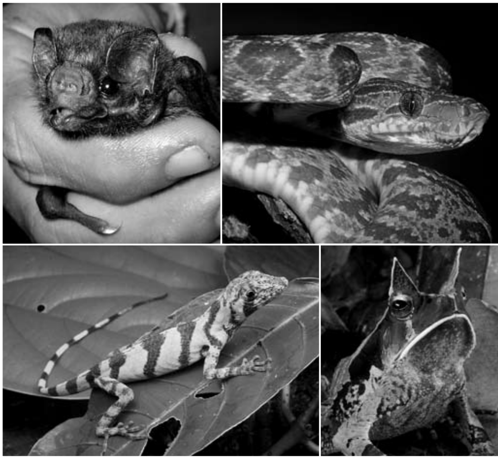
These photos illustrate several animals representing the region's phenomenal bio-diversity, which includes thousands of plant, bird, and amphibian species. Numerous such species are endemic or unique to the Napo Moist forest ecosystem.

versity, accounting for some 500 species. This extraordinary bird diversity includes numerous regional endemics restricted to the Napo Moist Forests. At least nine bird species in the ConocoPhillips block area are considered threatened in Peru according to a 2004 government listing of rare and endangered species in the country.