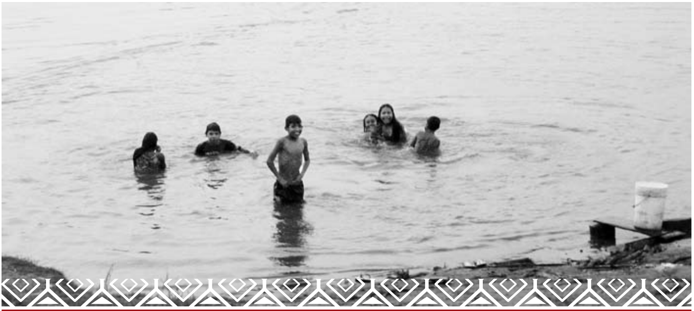
Indigenous children from the community of Buena Vista playing in the Arabela river