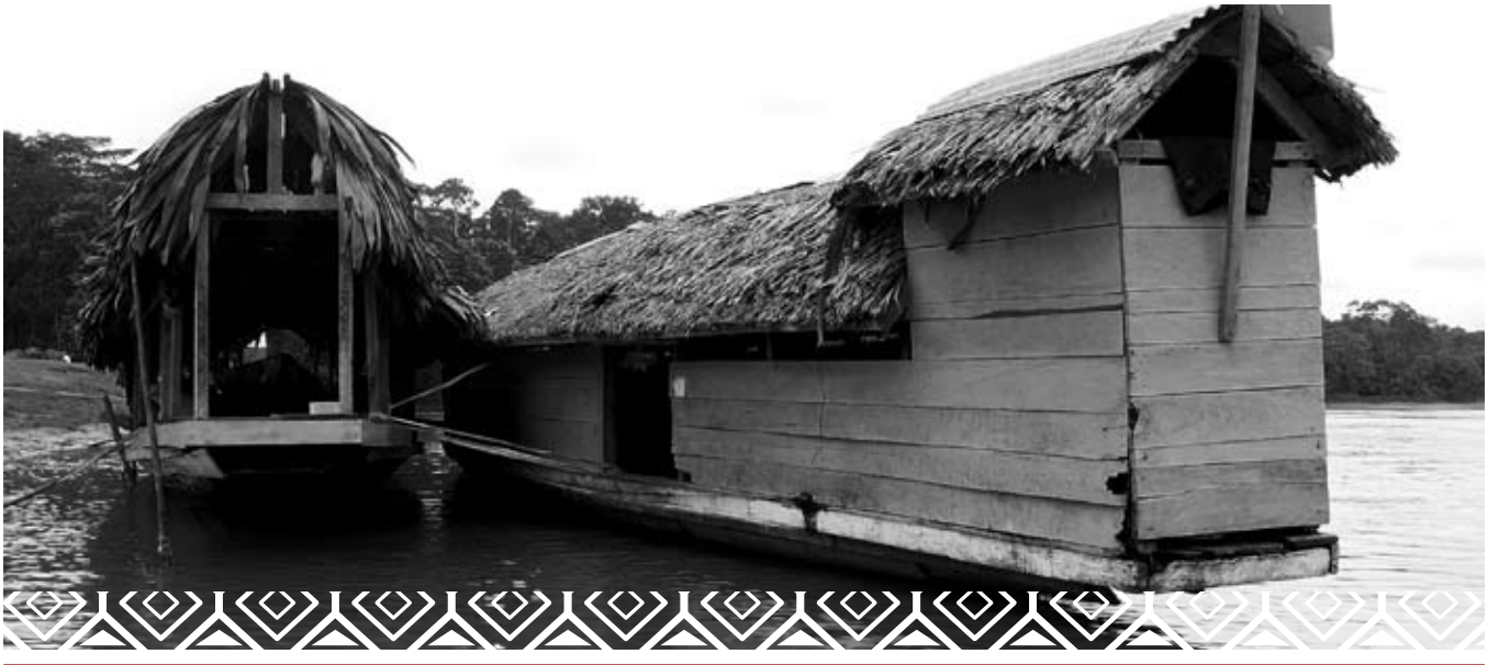
Commercial boats on the Curaray River close to the community of San Rafael