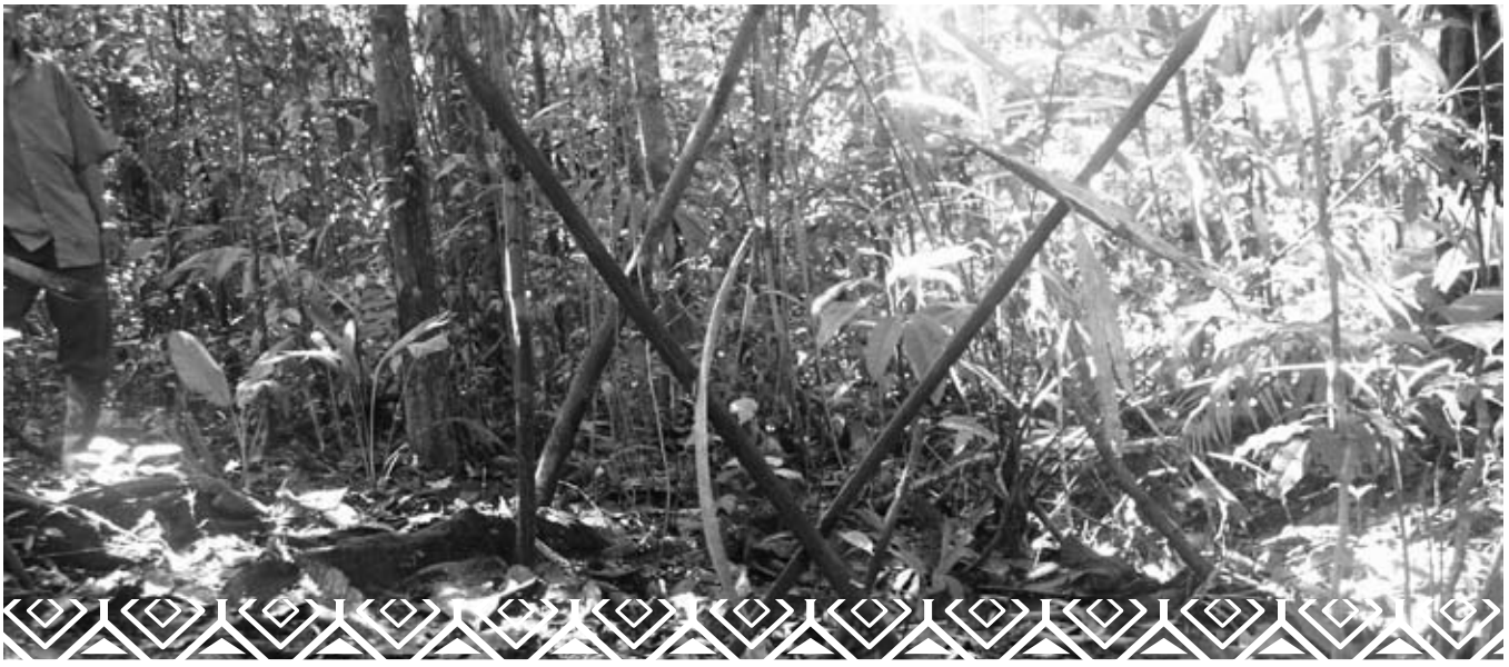
These crossed spears, left by indigenous groups deep in the forest, provide an unequivocal warning for outsiders to stay away. These were found near the Piraña oil field of Blocks 39, located in the core of the proposed Napo Tigre territorial reserve.