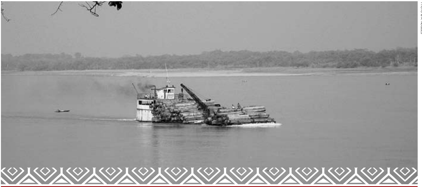
Illegal logging, facilitated by extensive waterways and a lack of state vigilance, poses a threat to the region's virgin forests.