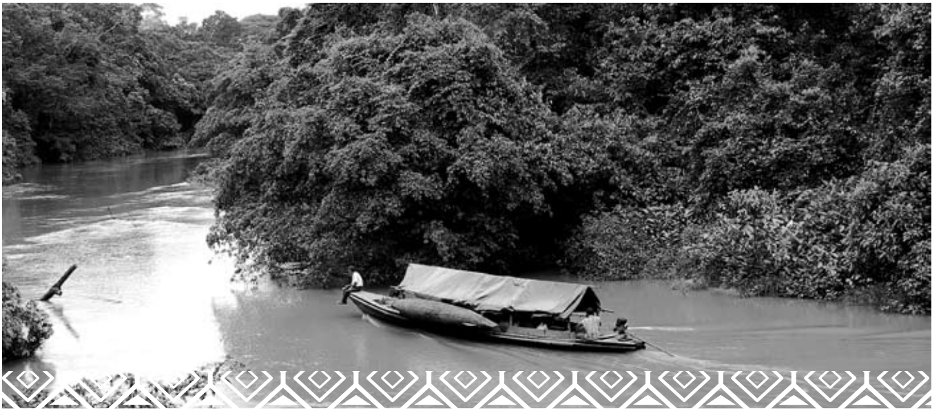
Game Hunters on the Upper Mazan River